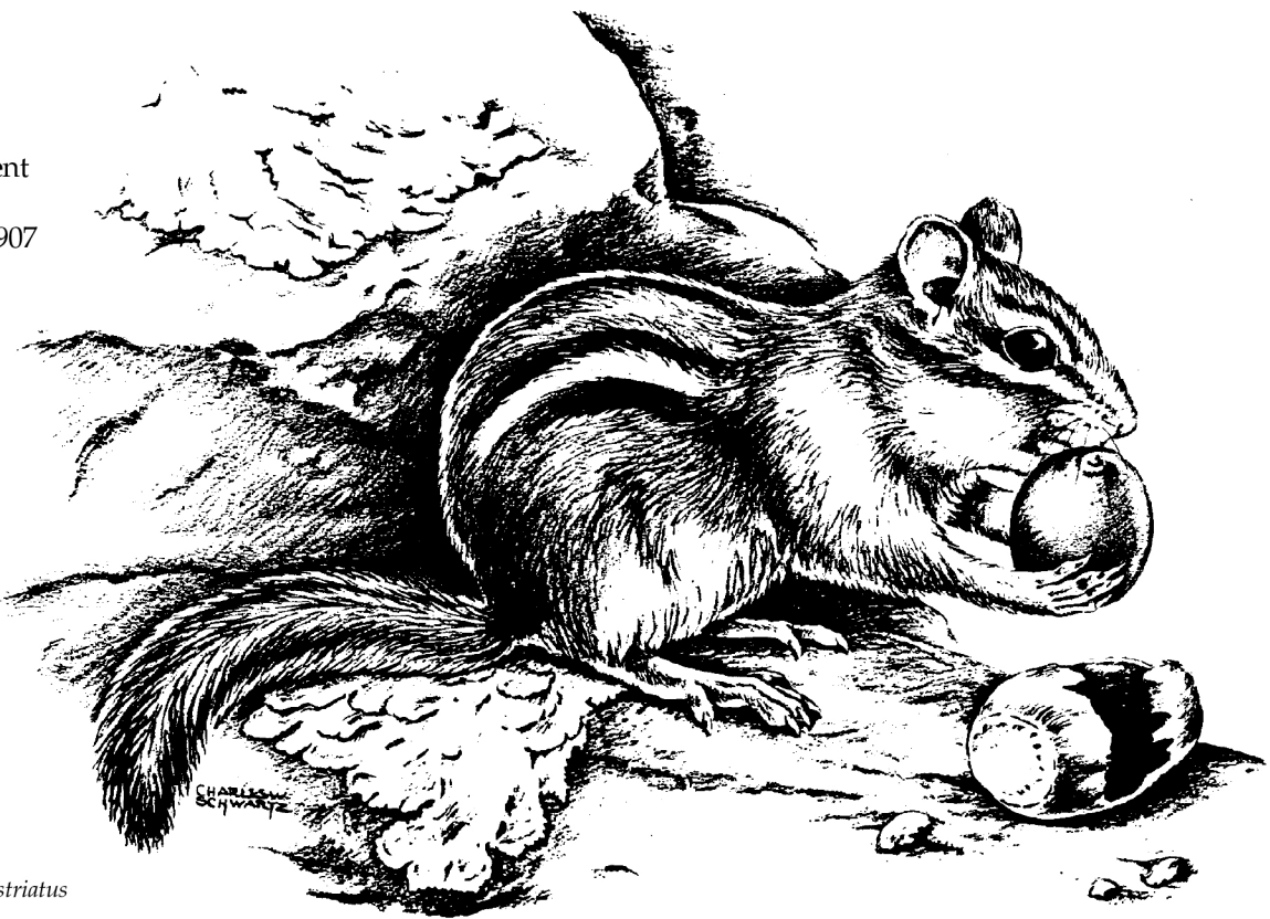
Fig. 1. Eastern chipmunk, Tamias striatus